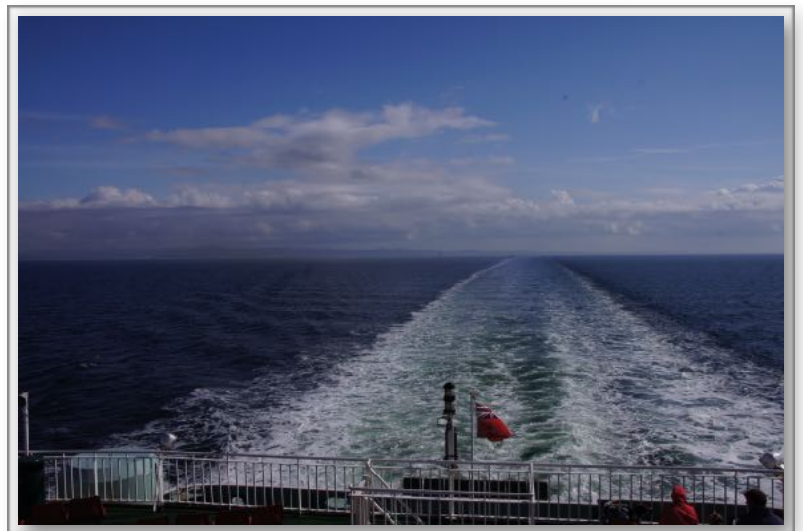
Leaving the mainland behind!